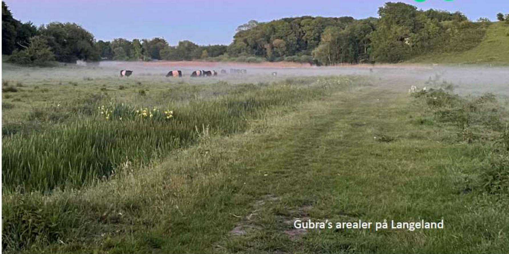
Gubra's arealer på Langeland